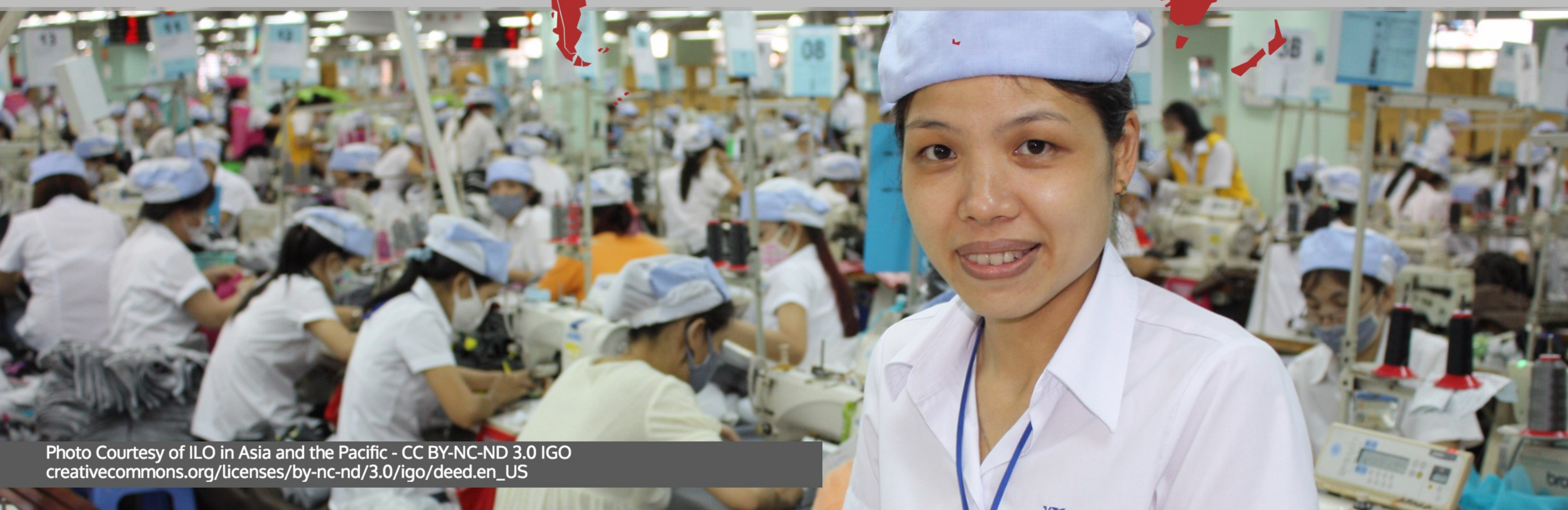
Photo Courtesy of ILO in Asia and the Pacific - CC BY-NC-ND 3.0 IGO creativecommons.org/licenses/by-nc-nd/3.0/igo/deed.en_US